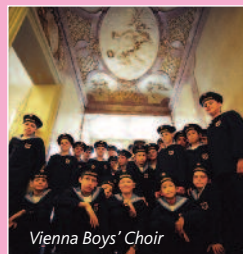
Vienna Boys' Choir

You're in the adopted home city of Mozart and there's a huge number of music venues including the State Opera, the Volksoper, Musikverein and the Konzerthaus. Pictured here are the cherubic Vienna Boys' Choir aching to sing their little hearts out.