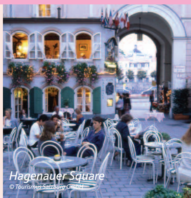
Hagenauer Square

To view hotels, prices and make a booking click www.arrowtours.ie and select SALZBURG as your destination city.