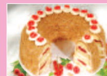
Frankfurt Ring Cake

Vienna is the true home of the Kaffeehaus and European café life was effectively invented here. The array of cafés with stunning selections of cakes, pastries and buns is mind boggling. Gorge you way around too many of them before retiring to your hotel to be sick.